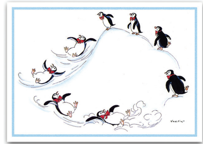
Mircea Vasiliu VM115